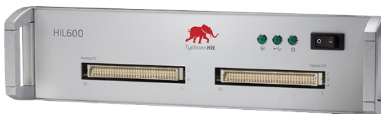
Frontpanel with anodized aluminium digital printing