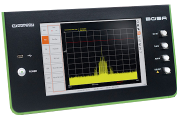
Thermal-Digital Printing with Display-Integration