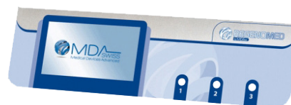
Anodized aluminium digital printing with Display-Integration