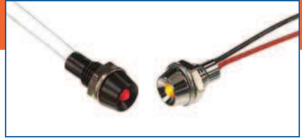
3mm Panel Mount LED Assemblies