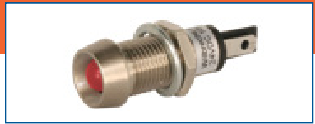
5mm Panel Mount LED Assemblies