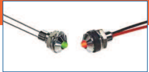
3mm Panel Mount LED Assemblies