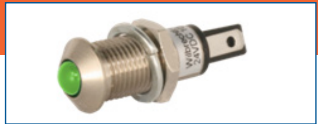
5mm Panel Mount LED Assemblies