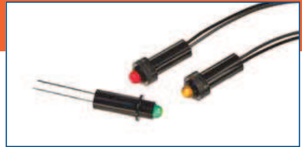
5mm Panel Mount LED Assemblies