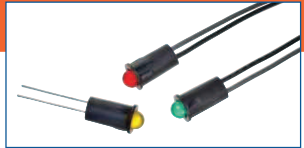
5mm Panel Mount LED Assemblies