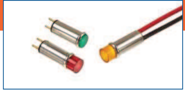
5mm Panel Mount LED Assemblies