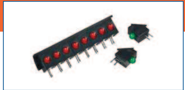
3mm PC Board Mount LEDs